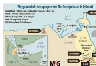
Figure 4: Foreign Military Bases in Djibouti

The figure below illustrates the annual tax or lease fees paid to Djibouti. The United States pays the highest amount, $63 million, followed by France at $36 million, China at $20 million, Italy at $26 million, while Japan's fees are not listed.