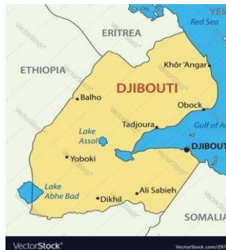
Figure 3: Map of Djibouti